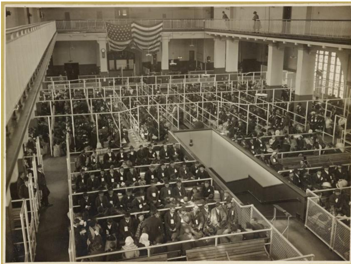
The Pens at Ellis Island, Registry Room (or Great Hall) c. 1902-1913

People from all over the world came to the United States through Ellis Island. They had to cope with a new language, new foods, finding a place to live, finding a job, and learning how to thrive in the land of opportunities!