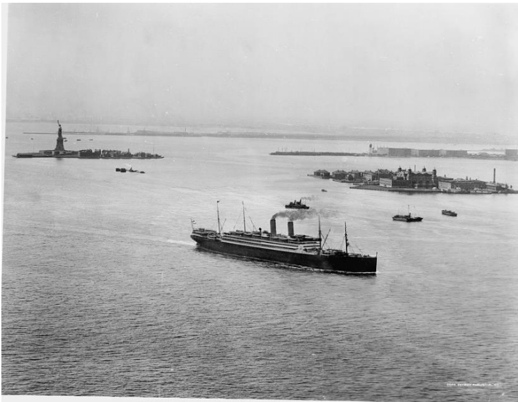
Ellis Island and Harbor, New York

The ships were crowded with sometimes up to 3,000 people. They spoke different languages, had different religions and cultures, yet, they all had the same dream, the opportunities of a new life in America.