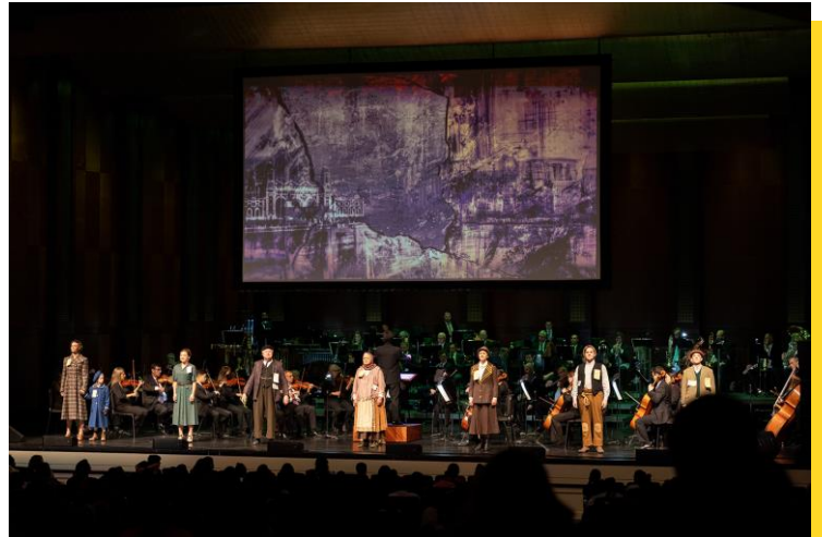
Ellis Island: The Dream of America at Bass Performance Hall

Ellis Island: The Dream of America was born out of my fascination with the relationship between history and music. I'm drawn to good stories—especially stories which come from the past but are relevant to the present—and as an orchestral composer, I'm intrigued by the potential of the orchestra as a storytelling medium. Of course, orchestral music cannot tell stories in a literal way, but its ability to suggest scenes and emotions, and evoke responses in listeners, has challenged and stimulated composers for centuries.