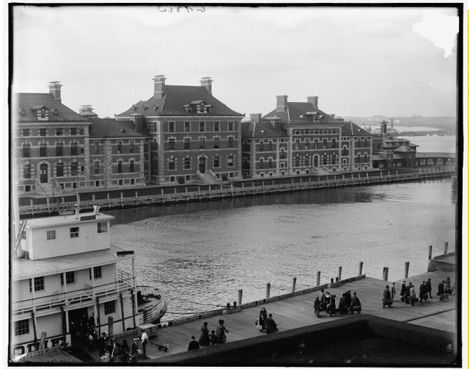
Hospital and Administration Buildings Immigrants landing at Ellis Island c.1910-1920.