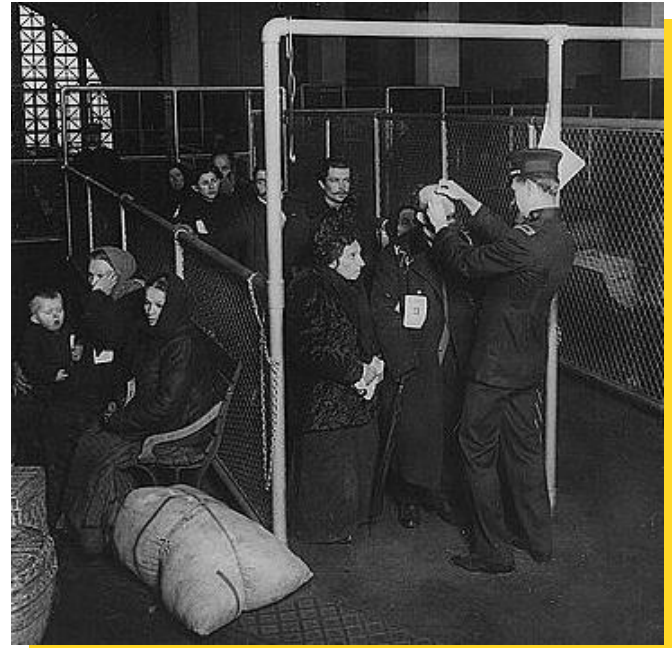
U.S. Inspectors examining eyes of immigrants Library of Congress c. 1913, by Underwood and Underwood

They had to prove that they would be able to earn a living and were asked how much money they had with them. Many of them came to meet family that was already living in the United States, yet many came without knowing a single person. There were more than thirty languages spoken in "The Great Hall" and translators were available at each registration booth.