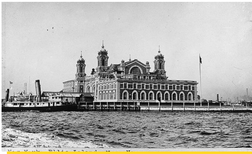
Immigration Building, home of "The Great Hall" New York, Ellis Island c.1918-1920.