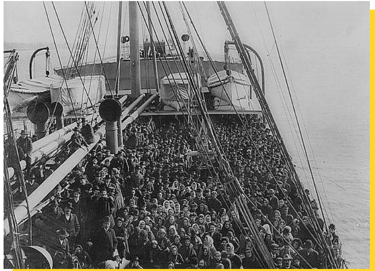
Immigrants on an Atlantic Liner Library of Congress c.1906, by Edwin Levick.

Most passengers could not afford first- or second-class tickets and so were kept in the “steerage”, a large open space at the very bottom of the ship. They would be thrilled when they could go on deck and breathe the fresh air and feel the sun.