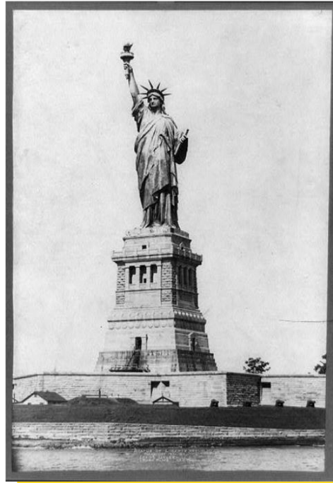
Statue of Liberty Library of Congress c. 1901, by Irving Underhill

At the base of the statue, is a selection of the poem "The New Colossus" by Emma Lazarus (1849-1887). A Jewish-American writer and activist from New York City.