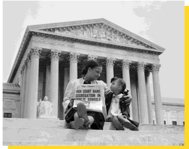
A mother and daughter sit on the steps of the Supreme Court Building, c. 1954

The Court's decision in Brown partially overruled Plessy v. Ferguson by declaring that the "separate but equal" notion was unconstitutional for American public schools and educational facilities. It paved the way for integration and was a major victory of the civil rights movement, and a model for many future impact litigation cases. Of course, it took many years to implement integration across the country and there is still work being done today to bring equity to public schools.