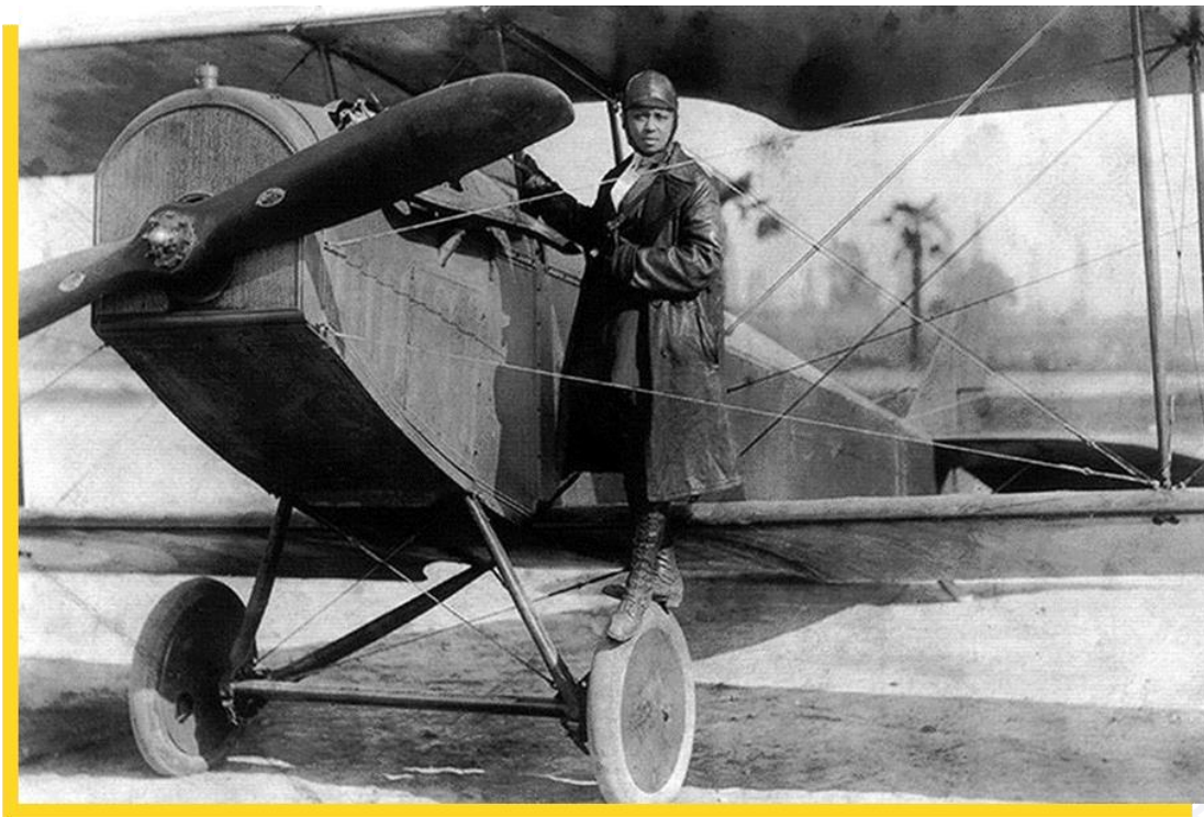
Bessie Coleman with a Curtiss JN-4D, “Jenny” c.1924

She worked for four years as a manicurist, while living with her older brothers. They had come back from World War I, with stories of women who were flying planes in Europe. That sparked her imagination, giving her dreams of learning to fly planes. No women, and no Black Americans, flew planes at that time in the United States.