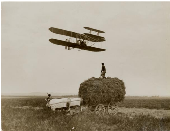
Wilbur Wright piloting the 1908 Wright Flyer in Pau, France.

Their bicycle repair business began to expand, and they eventually had five locations. They found out that airplanes and bicycles had a lot in common and towards the end of the 1890's, they began to build experimental airplanes. These first experimental unmanned airplanes, called Gliders, were nothing more than giant kites. They invented techniques in aeronautical engineering and flight testing that is still used today.